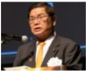
Welcome Speech TAKEMOTO Naokazu Minister of State for Science and Technology Policy, Cabinet Office, Japan

Many government officials and major project leaders participated and gathered to share the latest information and hold technical discussions on key issues at this international workshop on automated driving.