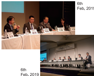
6th Feb. 2019