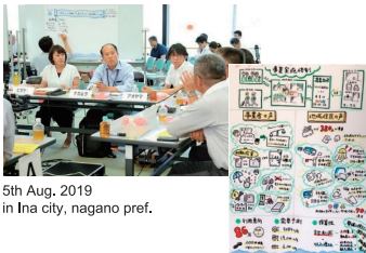
5th Aug. 2019 in Ina city, nagano pref.